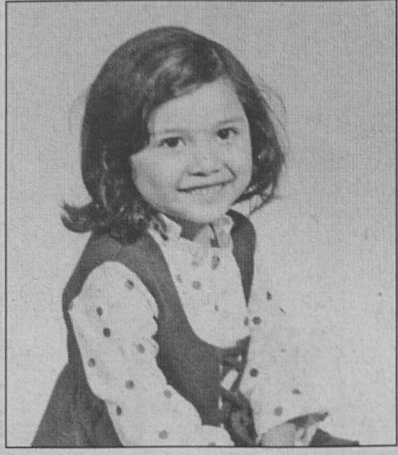
From Mom, Dad, Brother and the rest of the Family